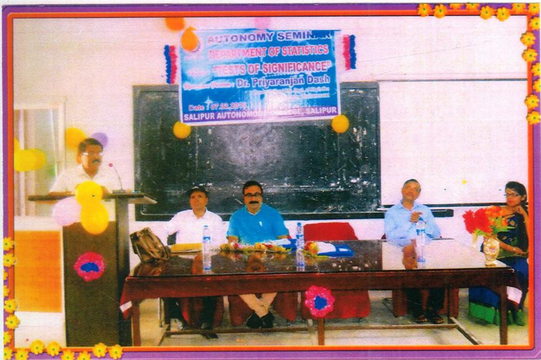
Presidential Address by Principal