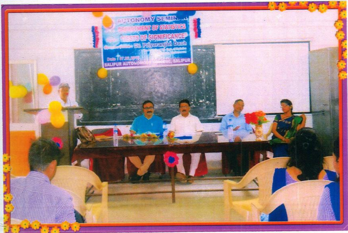
Guest Introduction by HOD Statistics